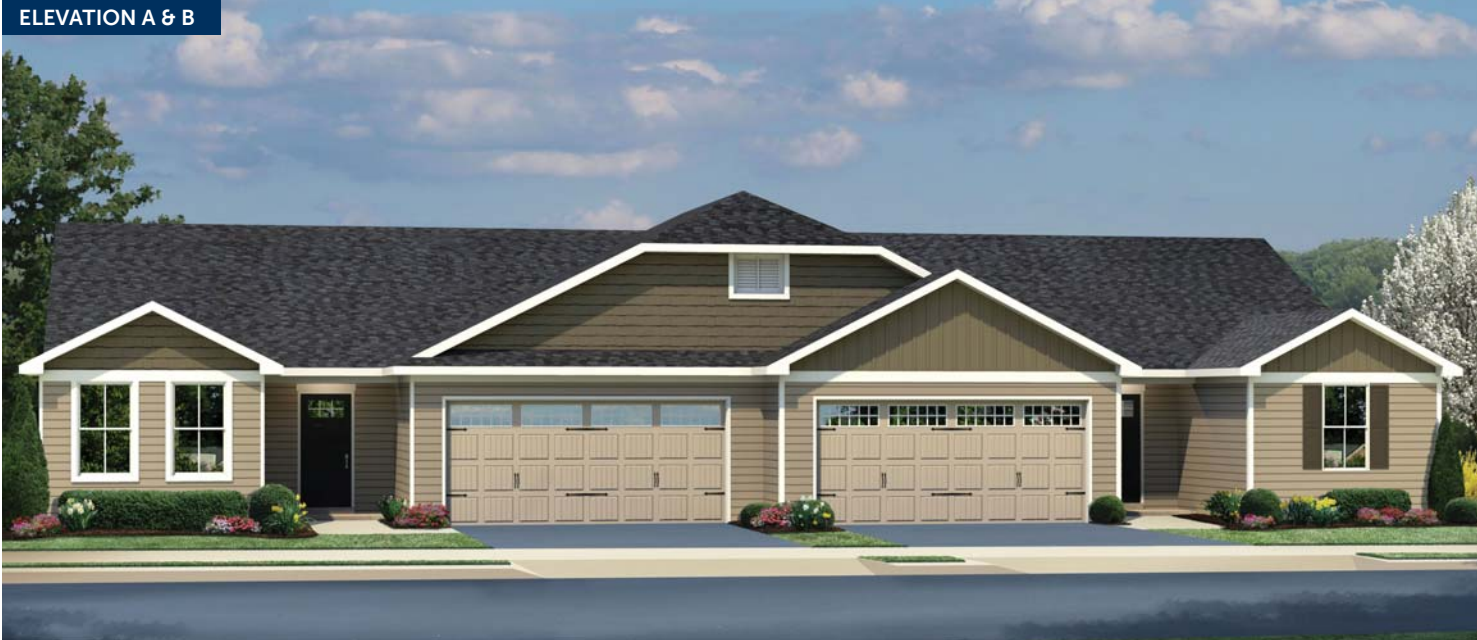
ELEVATION A & B