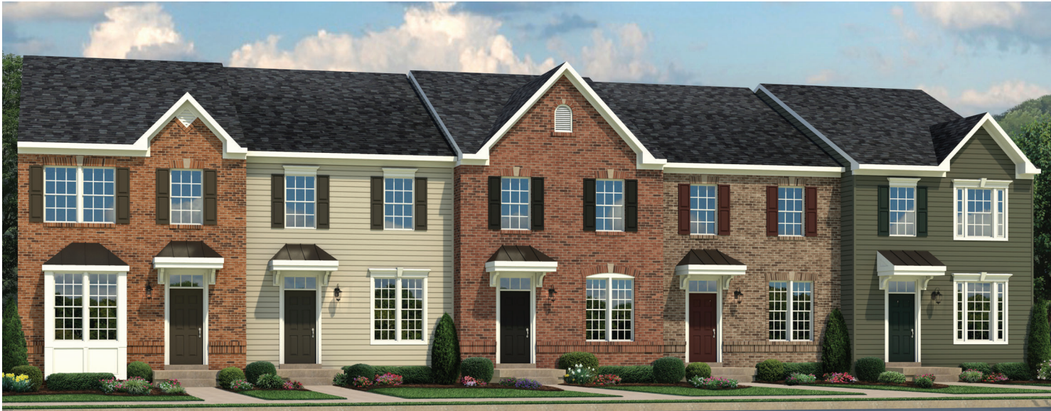
MAIN LEVEL ENTRY