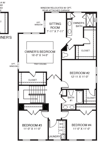
OWNER'S BATH #2 OPT. UPGRADE OWNER'S BATH W/ OPT. BATH #2