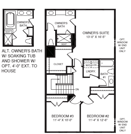
OPT. 4'-0" EXTENSION TO HOUSE