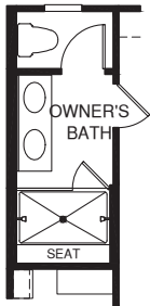
OPT. OWNER'S BATH W/ ROMAN SHOWER