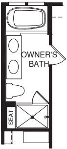
OPT. OWNER'S BATH W/ SOAKING TUB & SHOWER