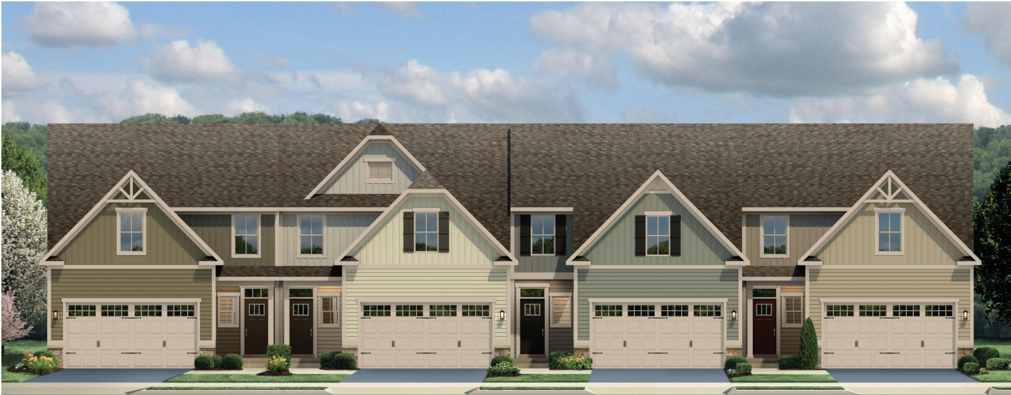
LEVEL ENTRY W/ BASEMENT