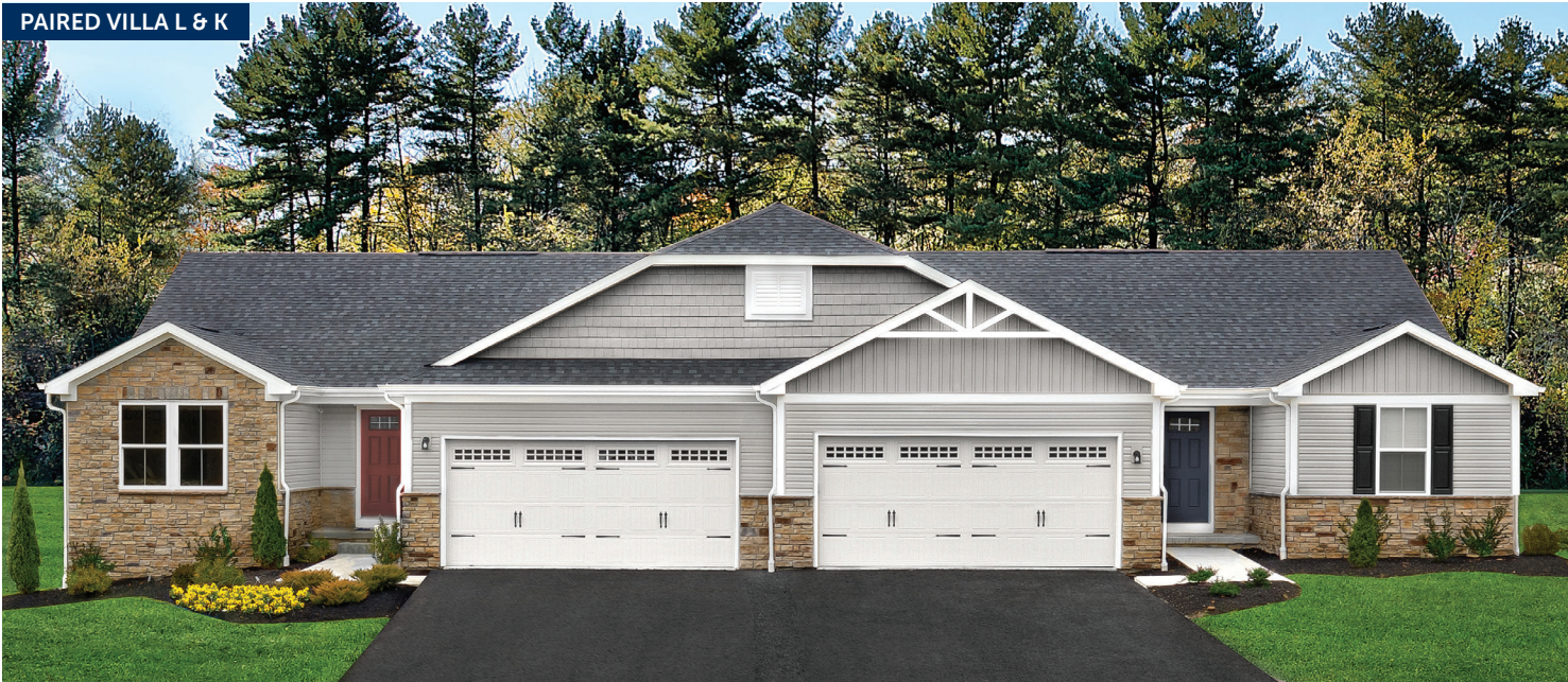
PAIRED VILLA L & K